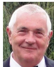
(IS-2050 Conference Secretary)